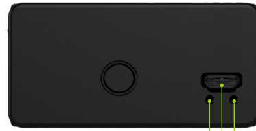
Status LED Micro USB Navigate LED